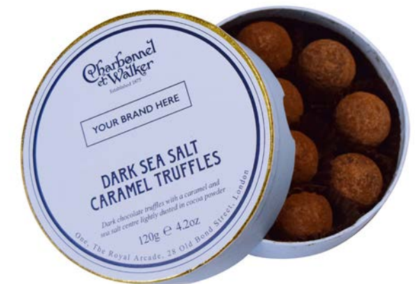
120g Dark Sea Salt Caramel Truffles