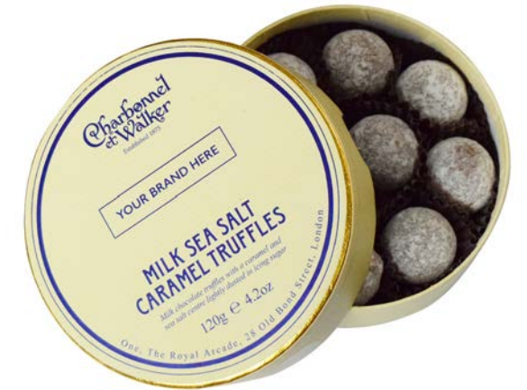
120g Milk Sea Salt Caramel Truffles

Personalise your Corporate Gift with your Company logo with one of our Classic Truffle Gift Boxes.