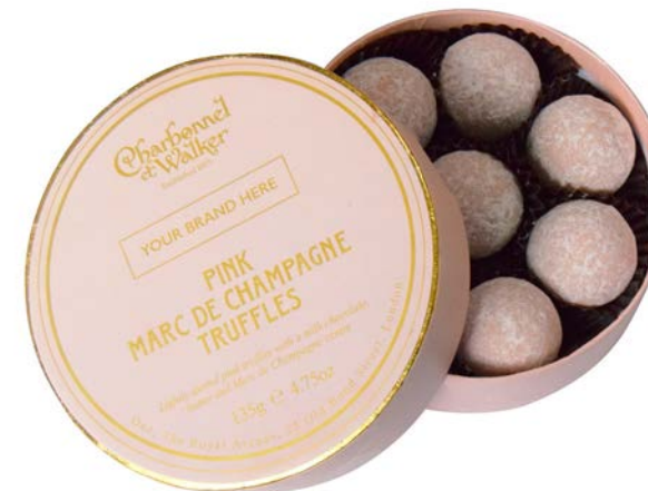
135g Pink Marc de Champagne Truffles

(Dimensions for your branding are 65mm W x 18mm H. All prices ex. VAT.)