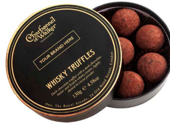
130g Whisky Truffles