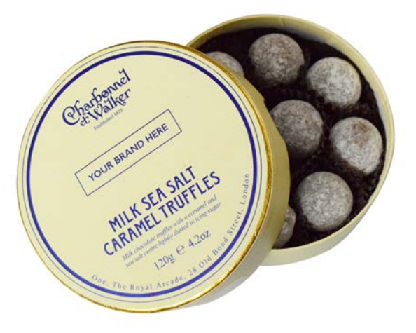
120g Milk Sea Salt Caramel Truffles