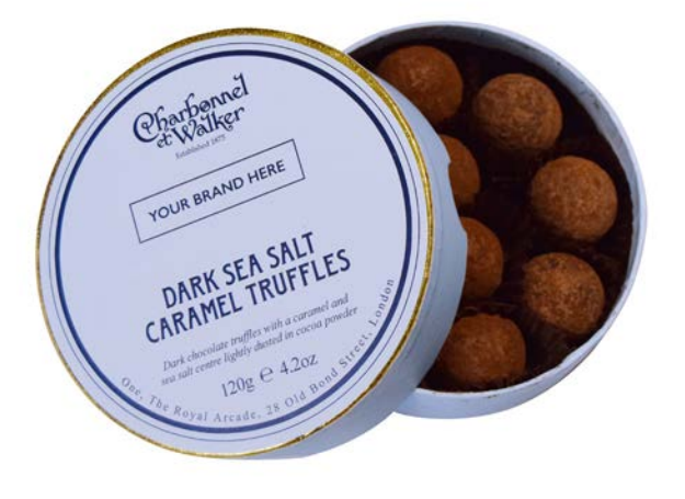
120g Dark Sea Salt Caramel Truffles