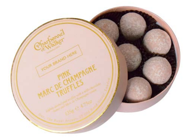
135g Pink Marc de Champagne Truffles