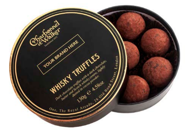
130g Whisky Truffles